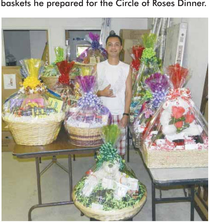
18 ☆ September 2012 ☆ Las Vegas Night Beat