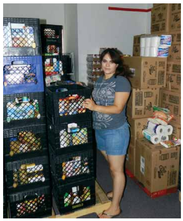
Las Vegas Night Beat ☆ September 2012 ☆ 17